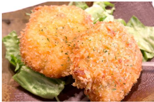
248. 茄子蓮根はさみ揚げ/ Nasu hasami Fried eggplant stuffed minced meat