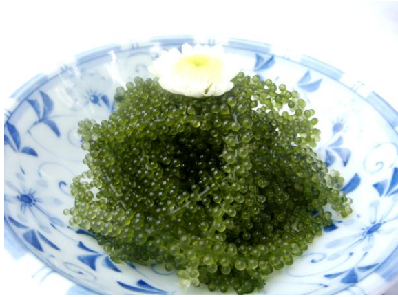
128.冷やっこ/ Hiyayako / Cold tofu / Đậu hũ