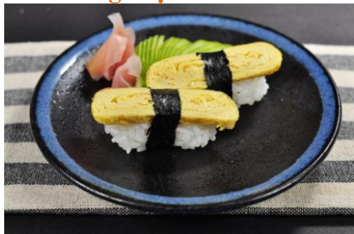
73. カニとび子/Crab meat Thịt cua