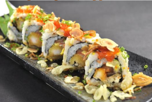
92. 天ぷらレインボーロール/ Tempura roll