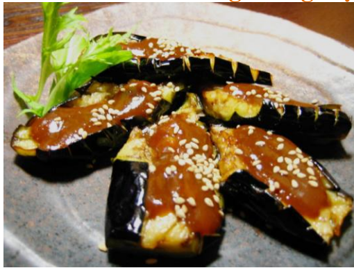
158a. エビ厚焼き玉子/ Ebi yaki tama / Egg,shrimp rolls / Trứng cuộn tôm