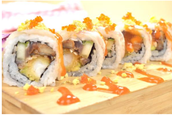
101.太巻き/ Futomaki / California roll