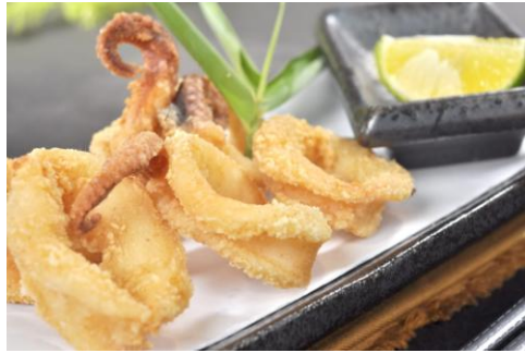
256.小海老唐揚げ/ Koebikaraage Fried small shrimp /Tôm đồng chiên