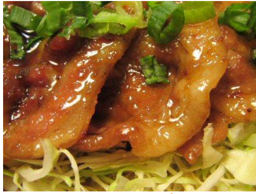
239. さつまいもチップ/Satsuma imochip Sweet potato chips / Khoai lang chiên