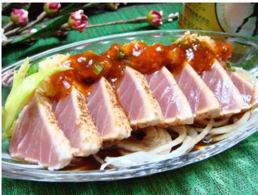
63. 鮪/Tuna/ cá ngừ