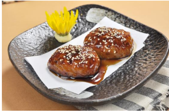
225.ゲソ七味焼き/ Gesoshichimi Grilled squid legs / Râu mực nướng cay