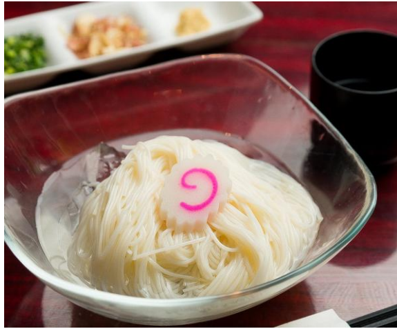
307.かけうどん/そば /Kakeudon/soba Buck wheat / white noodles soy soup