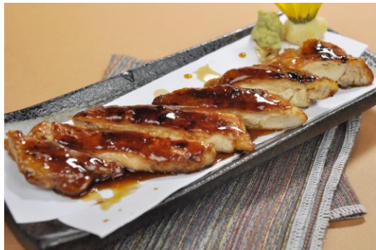
235b.豚照り焼/Butateri / Pan fried pork teri/Heo nướng teri