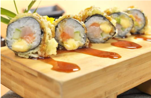
94. ホワイトタイガーロール/ Tiger roll