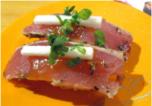
87. ミスサイゴンロール/ Ms saigon roll